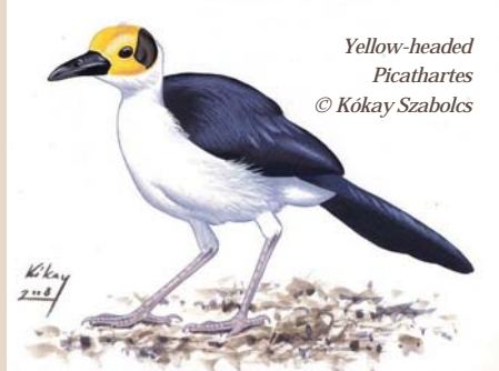
Yellow-headed Picathartes © Kókay Szabolcs