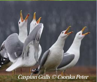
Caspian Gulls