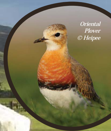
Oriental Plover