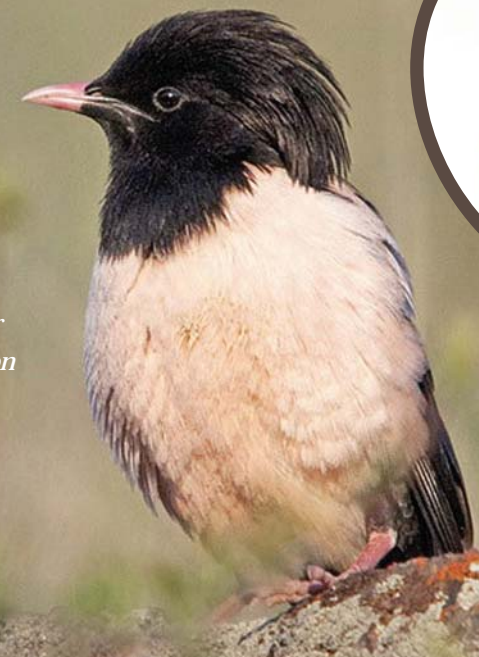
Rose-coloured Starling

Mid April to June for breeding birds, August, September for massive bird migration