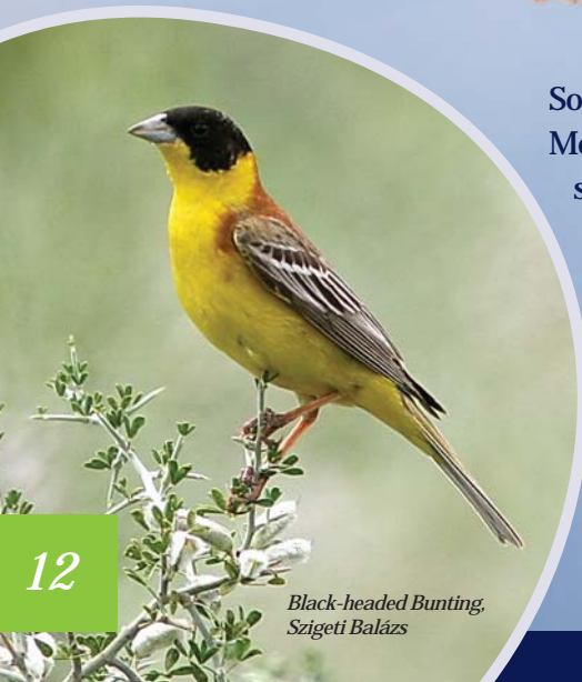
Black-headed Bunting, Szigeti Balázs

Southern Turkey has productive wetlands, Mediterranean woodlands and shrub and scenic snow-covered mountains. Target species include Dalmatian Pelican, Eleonora's Falcon, Spur-winged Plover, White-throated Kingfisher, Finsch's Wheatear, White-throated Robin, Olive-tree Warbler, Ruppell's Warbler, Kruper's Nuthatch, Masked Shrike, Red-fronted Serin and Cretschmar's Bunting.