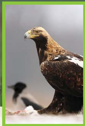
Imperial Eagle