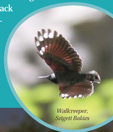
Wallcreeper

With the biggest population of Brown Bears, Wolves and Lynx in Europe, Transylvania offers outstanding birding and wildlife. Our holidays feature bearwatching opportunities from professional and secure hides with a very high success probability. Wallcreeper, Ural Owl and Eagles star in the gorges, valleys and mountains. The famous Danube Delta is no doubt the best area for birding at leisure, being on a high quality floating hotel in the middle of the wilderness. Fall asleep to the chorus of frogs, wake up with Pelicans nearby while you are having breakfast on-board. Whilst surrounded by an amazing number of waterbirds, Black and Grey-headed Woodpeckers fly overhead, Penduline and Bearded Tits commute over the reeds and Rollers whilst Hobbies put on aerial shows.