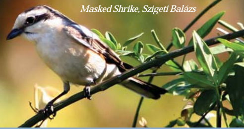
Masked Shrike, Szigeti Balázs