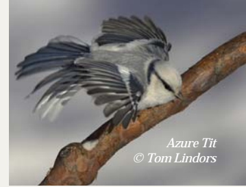
Azure Tit