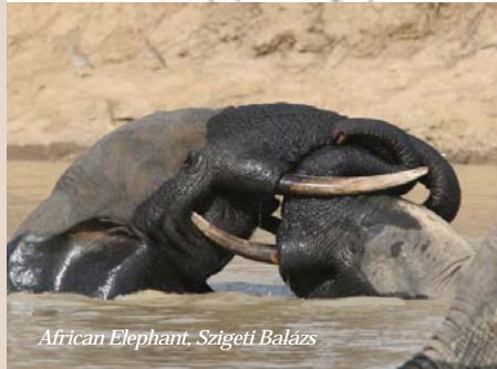
African Elephant, Szigeti Balázs