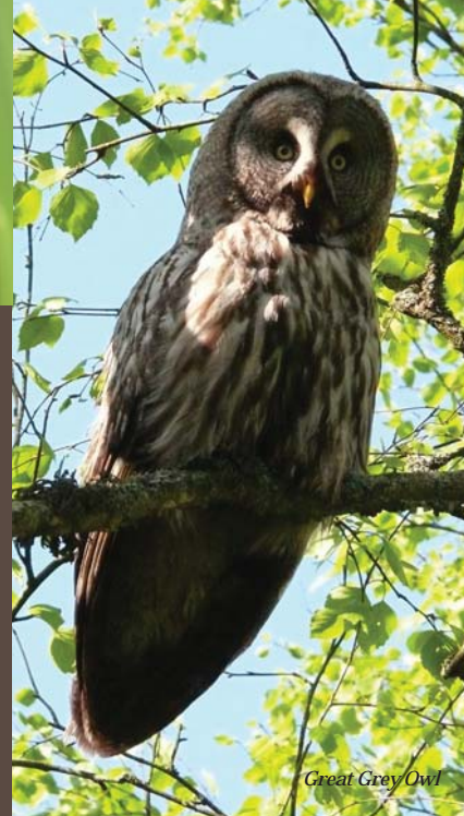
Great Grey Owl