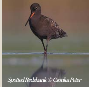
Spotted Redshank

Professionally guided birdwatching, photography and specialized wildlife holidays in Eastern Europe