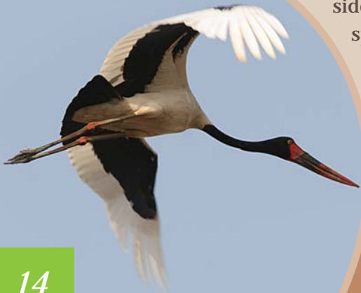
Saddle-billed Stork, Szigeti Balázs

Fishing Owl, Black Bee-eater, Standard-winged Nightjar, Brown-cheeked Hornbill, Rufous-sided Broadbill, Blue Cuckoo-shrike, 24 species of bulbuls, many colourful sunbirds and starlings. In addition, Mole National Park offers a good selection of African savannah mammals.