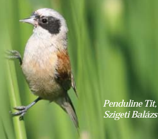
Penduline Tit. Szigeti Balázs