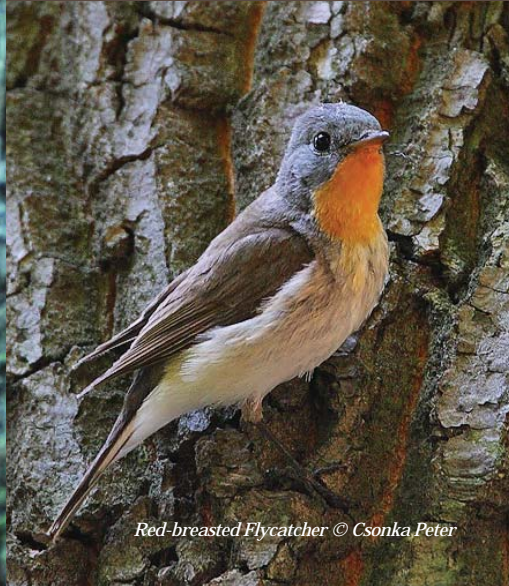
Red-breasted Flycatcher