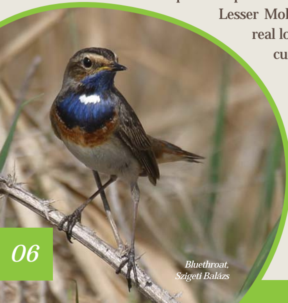
Bluethroat, Szigeti Balázs

Mid April to June for breeding birds. June & July for birds, butterflies and dragonflies. August to October for massive bird migration and premigration gathering of several interesting species. November to March for wintering birds in the mountains and steppes