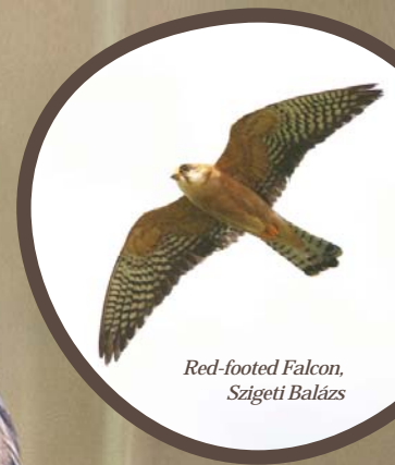
Red-footed Falcon, Szigeti Balázs