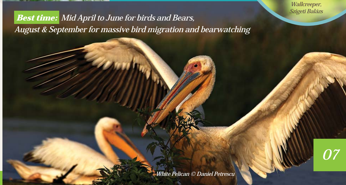
White Pelican

Best time: Mid April to June for birds and Bears, August & September for massive bird migration and bearwatching